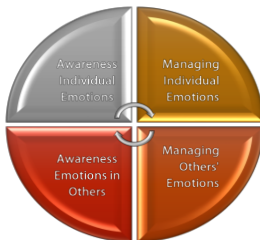
Figure 2: Affective applications in Emotional Work-readiness

In practice when a student focuses on the application of Technology and Resource Use (column 3, Table 1) to find and generate information it is not uncommon at the beginning of a placement to reflect on “ do my existing skills support my role? ” The cognitive reflection here is on knowledge competence where the student questions his ability of knowing.